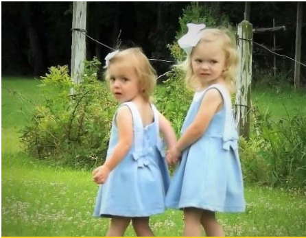
Ages 24 months and 34 months